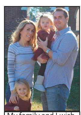
My family and I wish each and every one of you a warm, blessed holiday season filled with laughter, love, and the kinds of gifts that really matter.

This holiday season, take a good look at your student. Notice her face light up as she correctly pronounces that new vocabulary word. Watch as he carefully writes the answers to that worksheet you assigned. Revel in the smiles of gratitude or the trinket of appreciation you're given. You are changing a life. What an incredible gift.